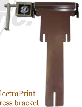
ElectraPrint press bracket

Speed is the answer. Designed to fit Electraprint and MasterPrinter series machines. These units speed up set-up of jobs with quick screen load and pinpoint registration. With the use of a provided art template, this backlit table is a 3-point registration fixture. The 3 set points that the screen sits against light up when the screen is in the proper position.